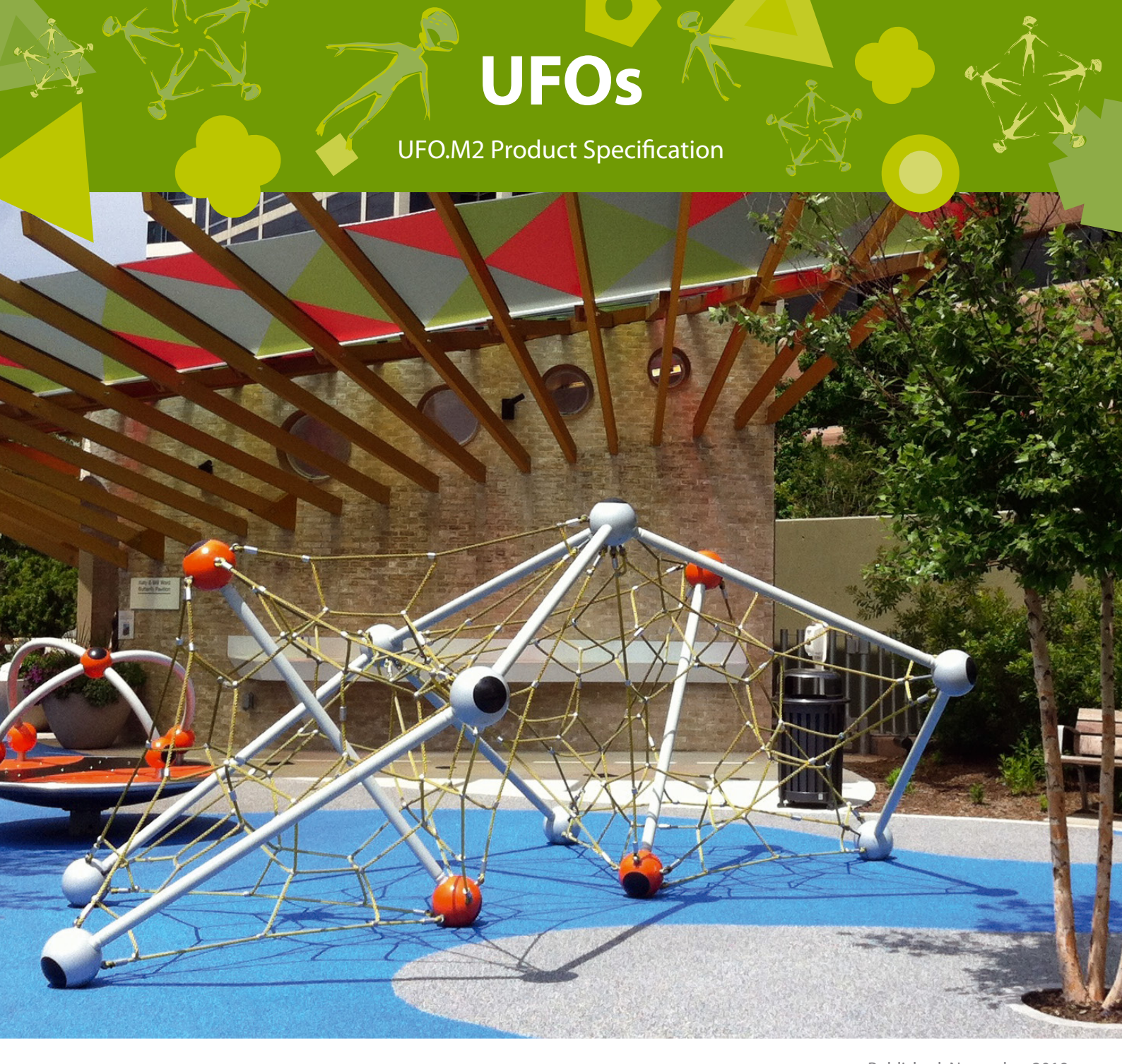
Published: November 2019