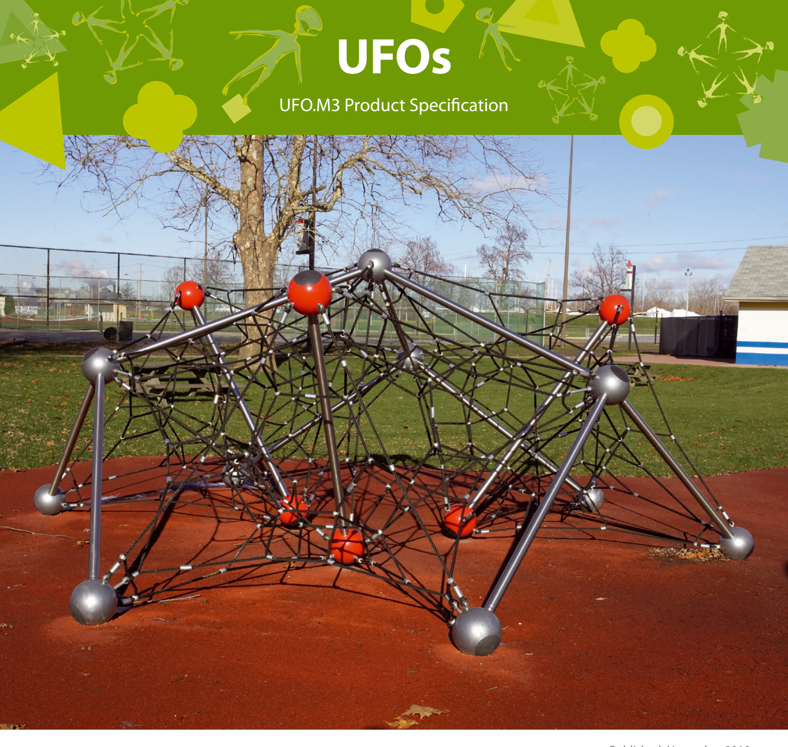
Published: November 2019