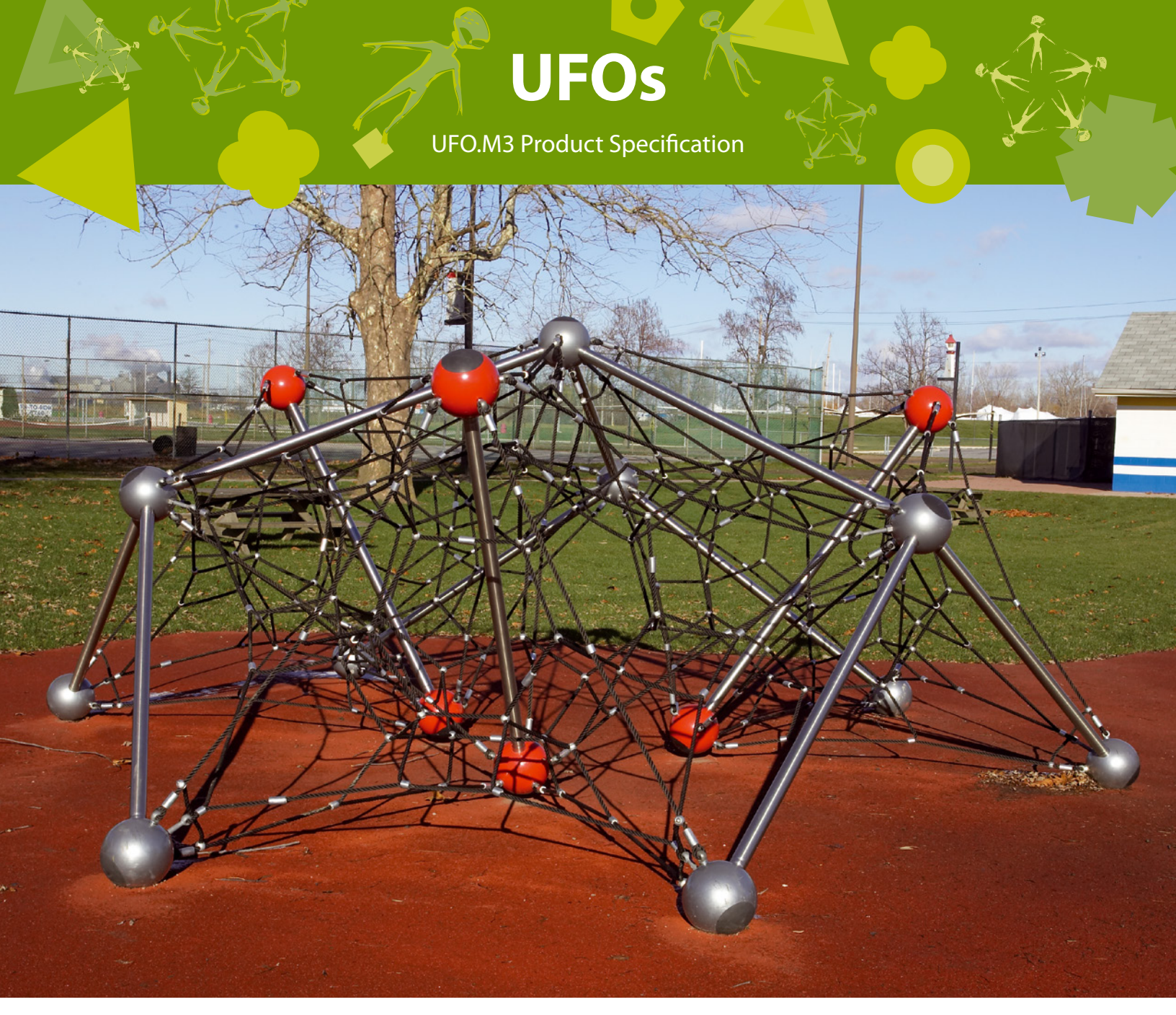
Published: November 2019