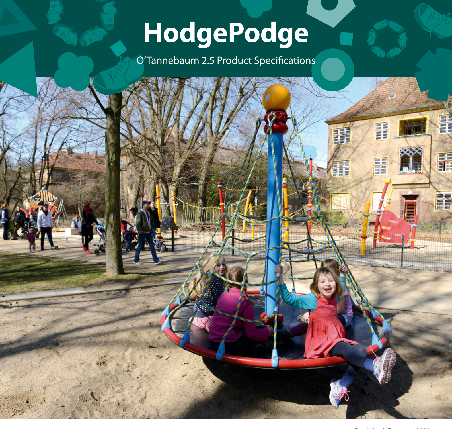
Published: February 2022