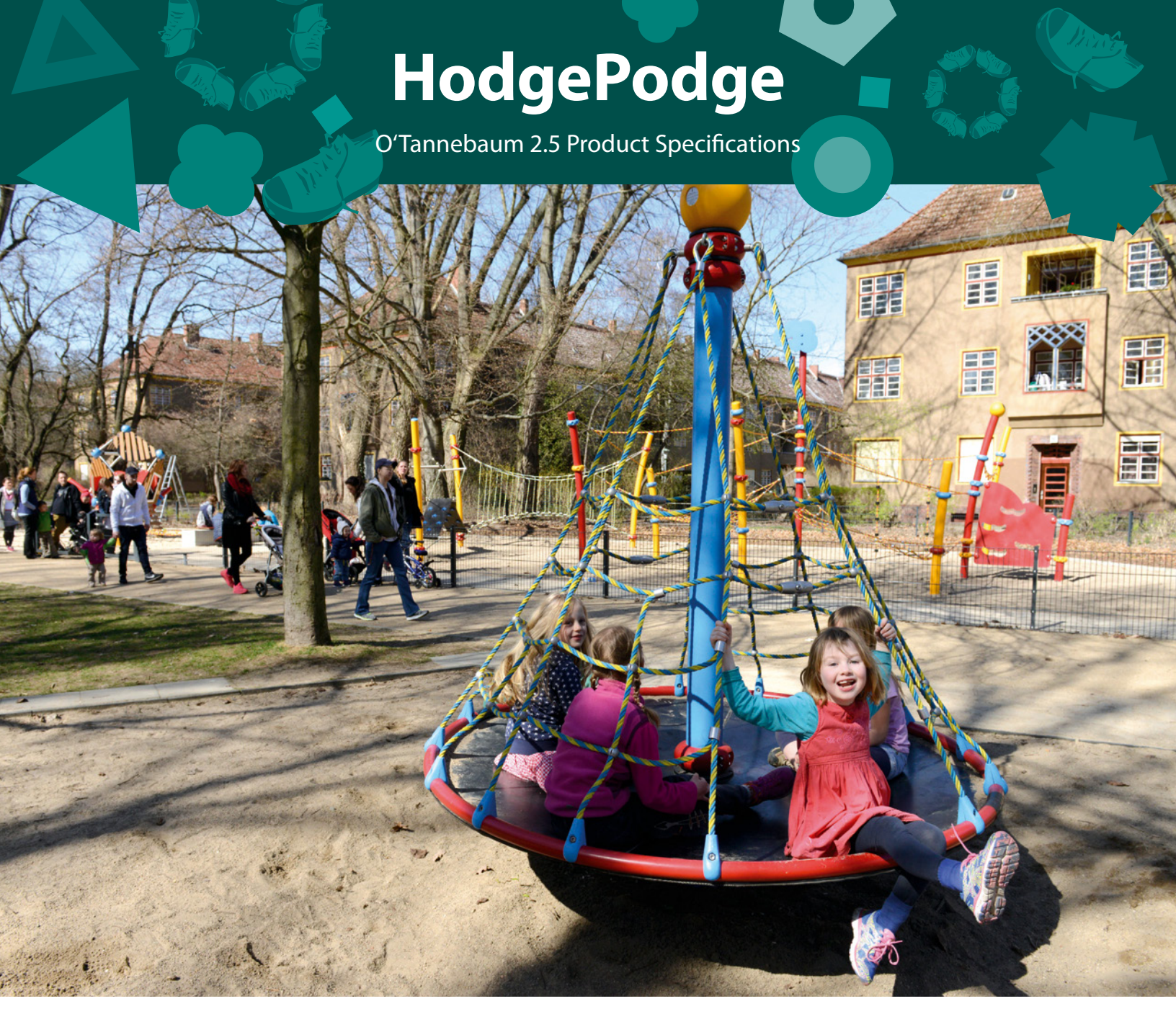
Published: February 2022