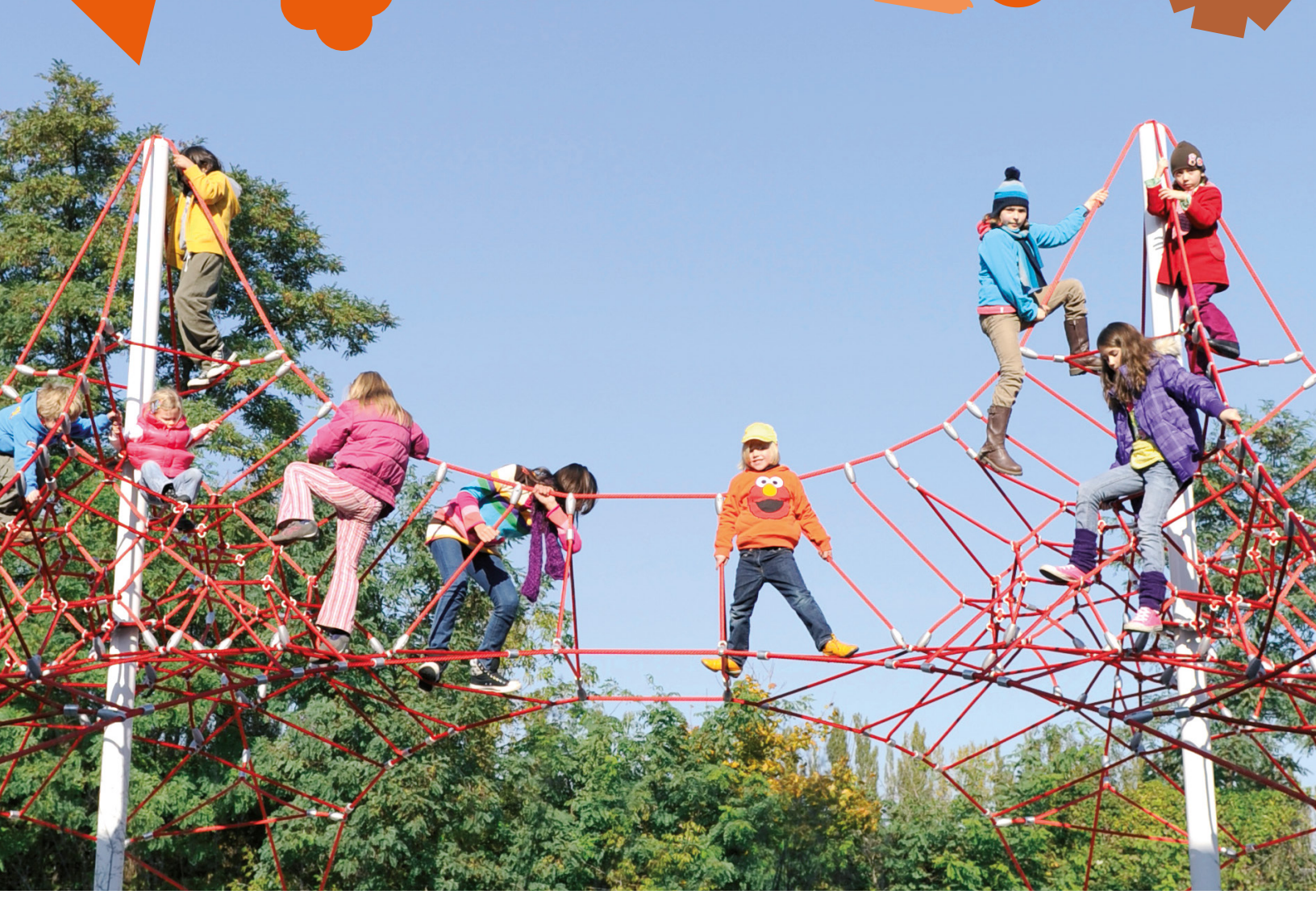
Published: June 2022