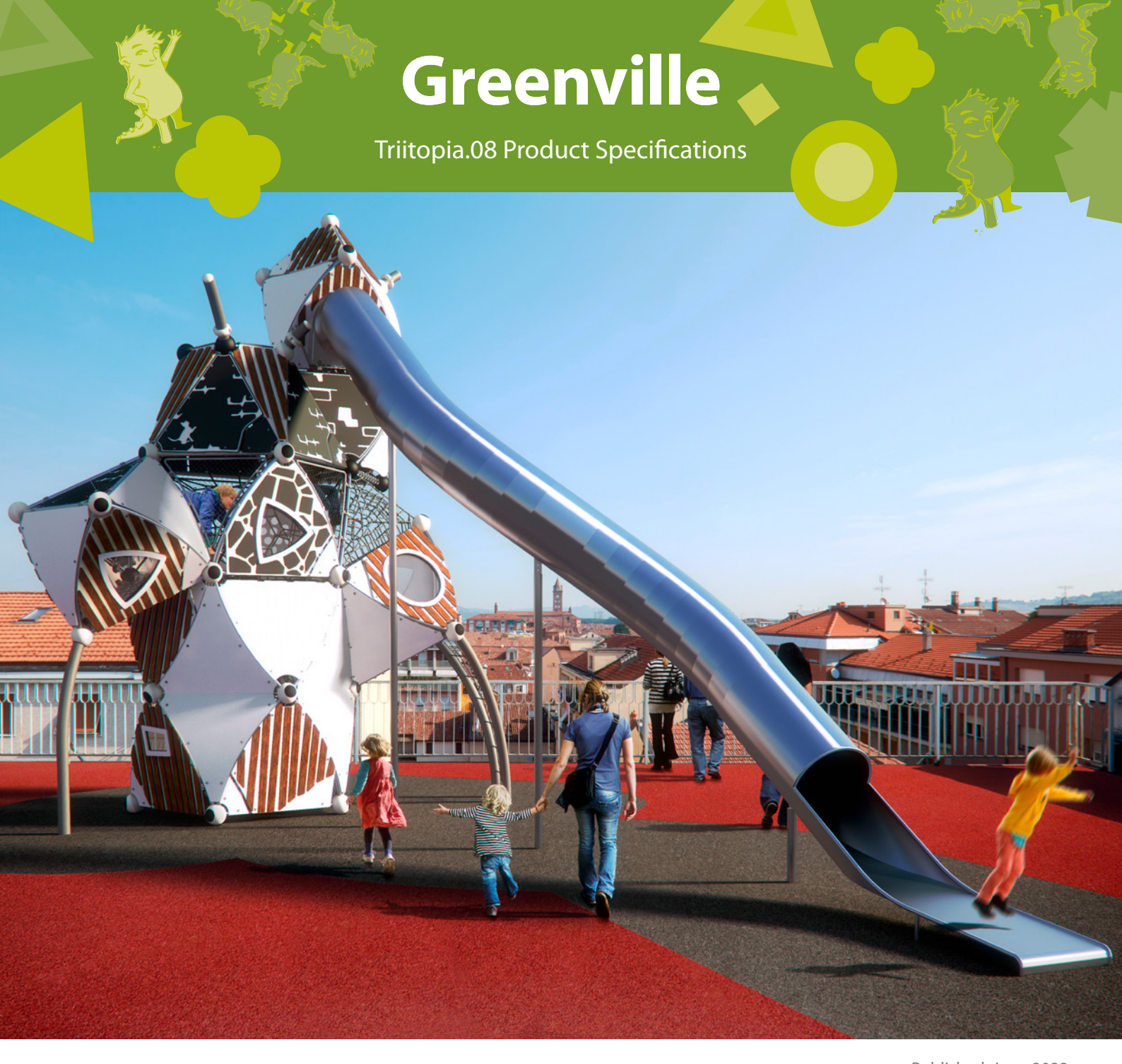
Published: June 2022