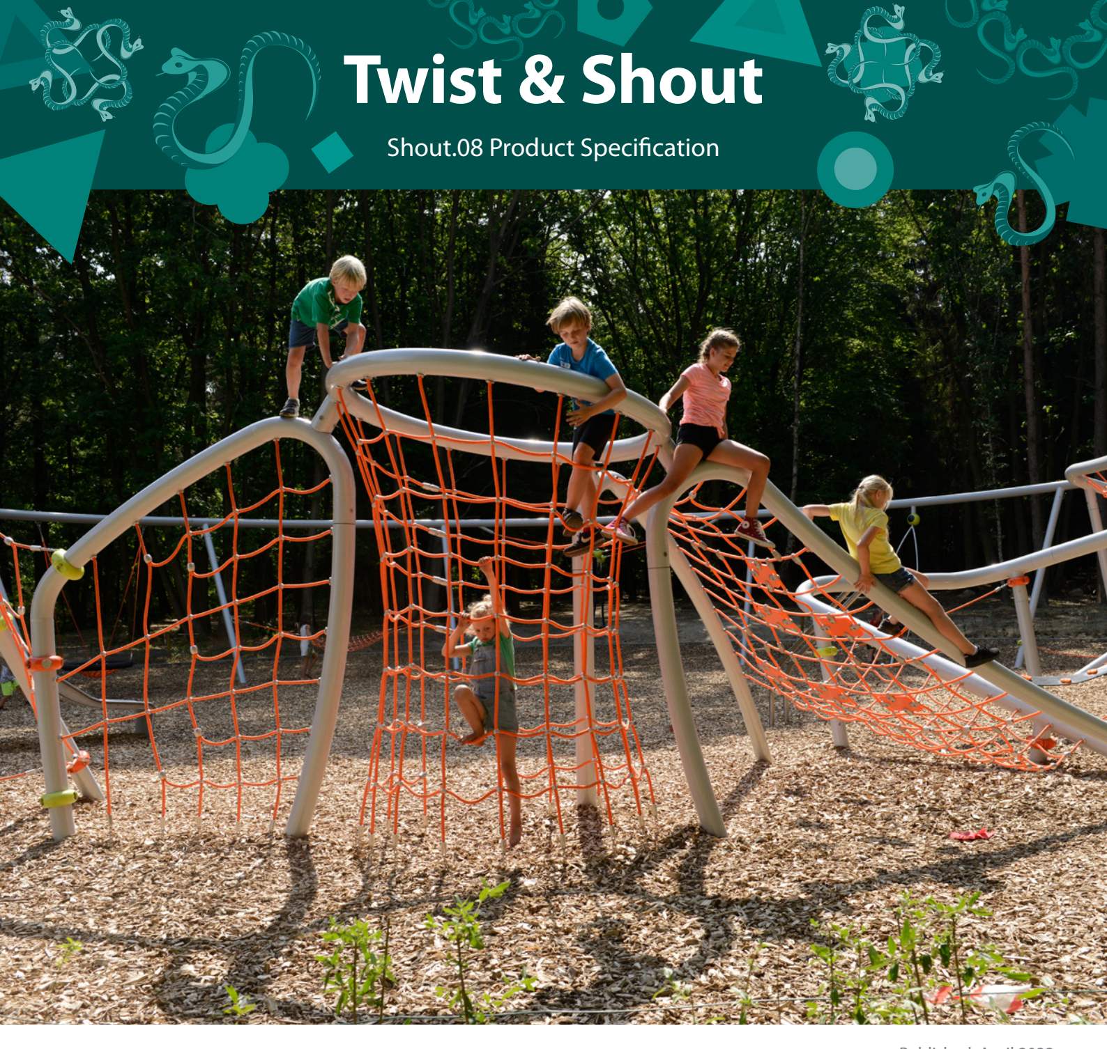
Published: April 2022