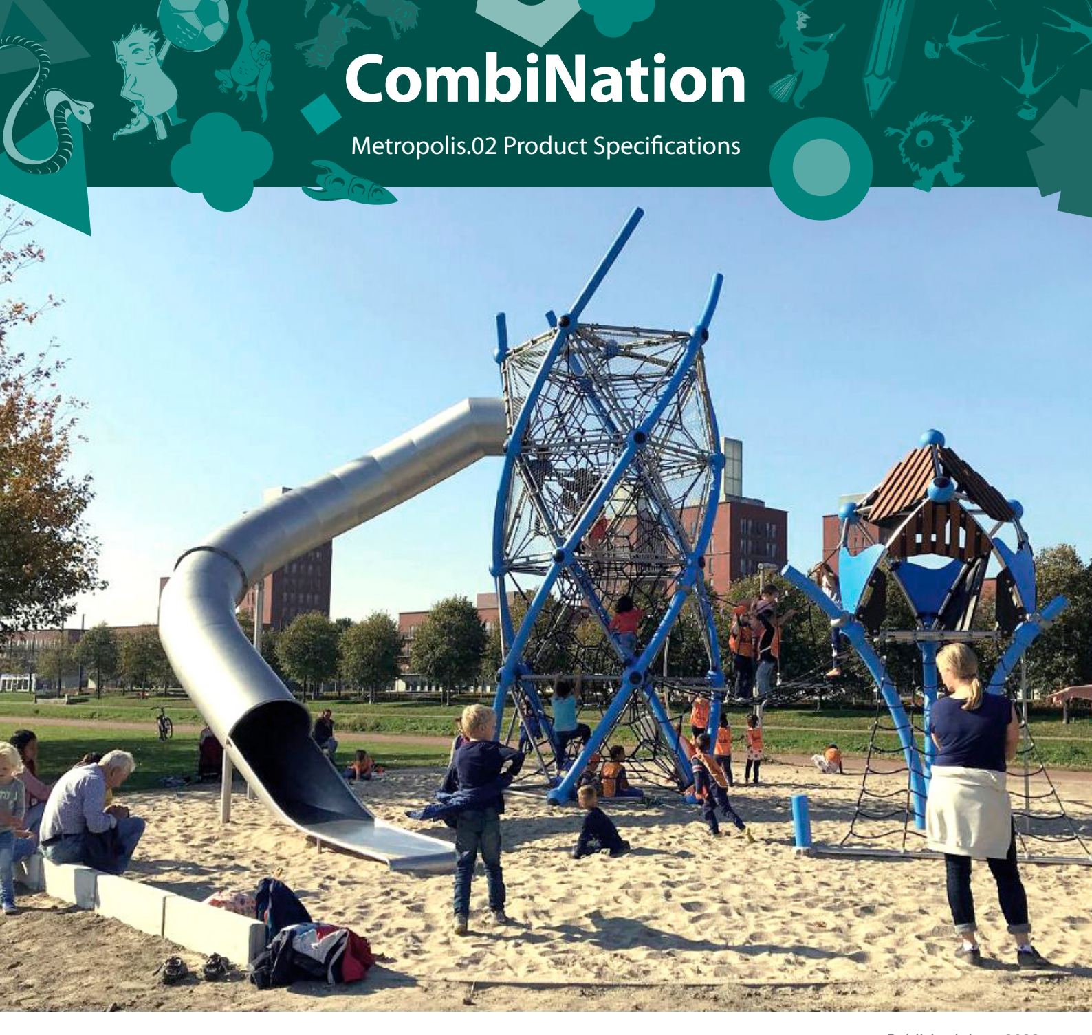
Published: June 2022