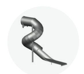
Spiral Tube Slide

You can complement LaGrange with a fast-paced Spiral Tube Slide, a Curved Slide or a Fast Lane Slide made of HDPE and customized according to your theme.