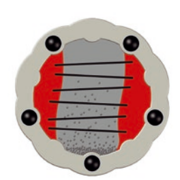
Make It Rain

Move the ball with the spinning disc and find the exit of the maze.